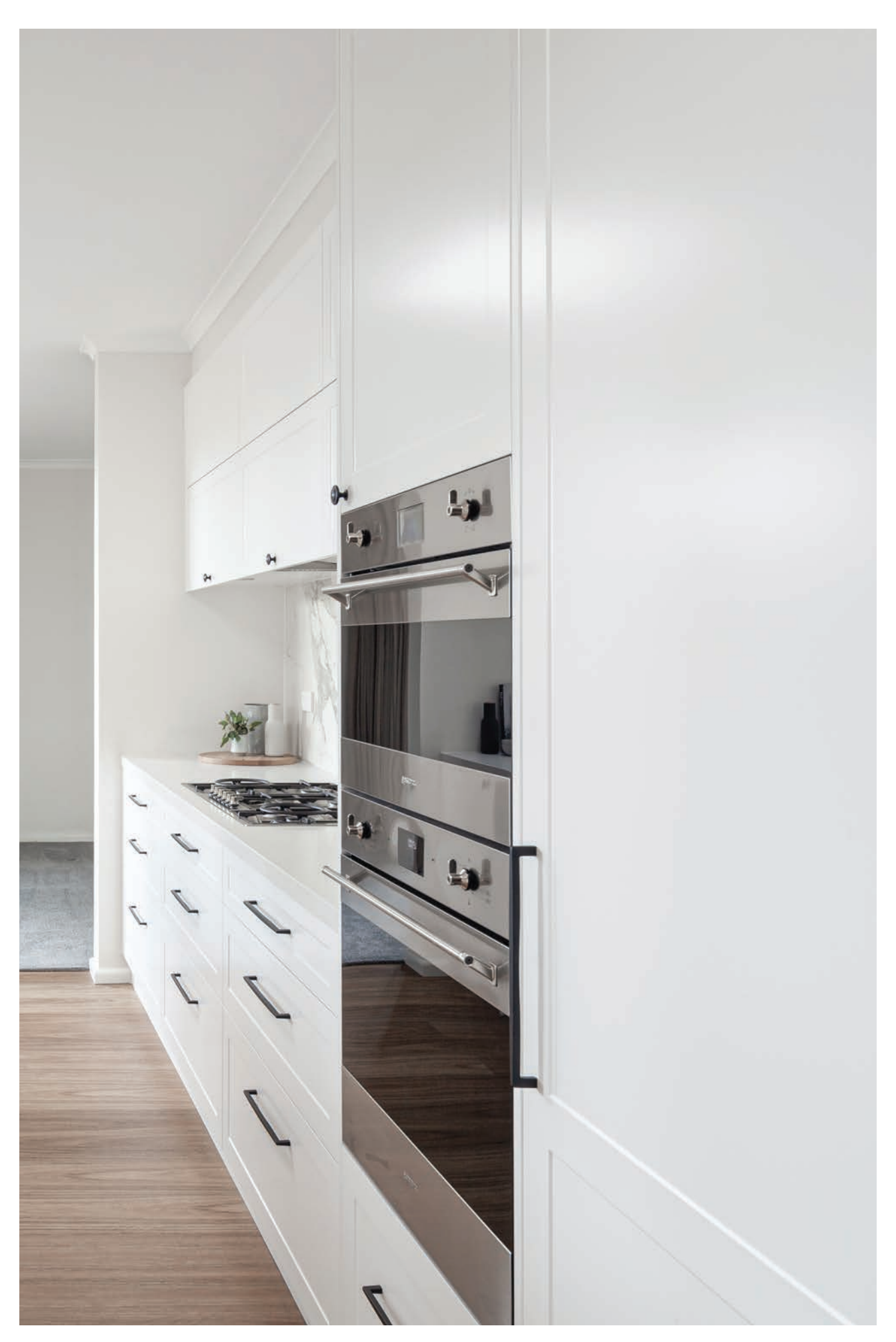
door design: sheree square