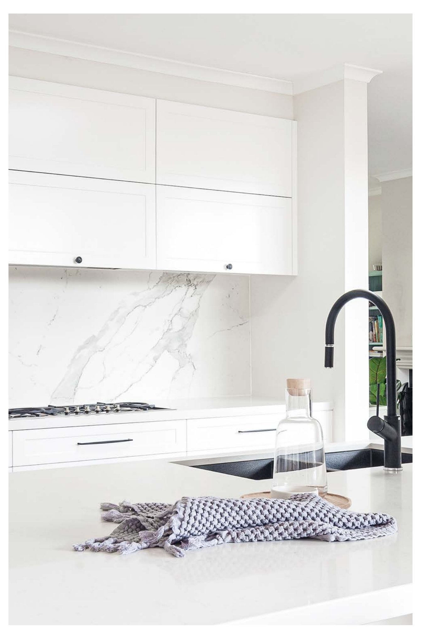
door design: sheree square